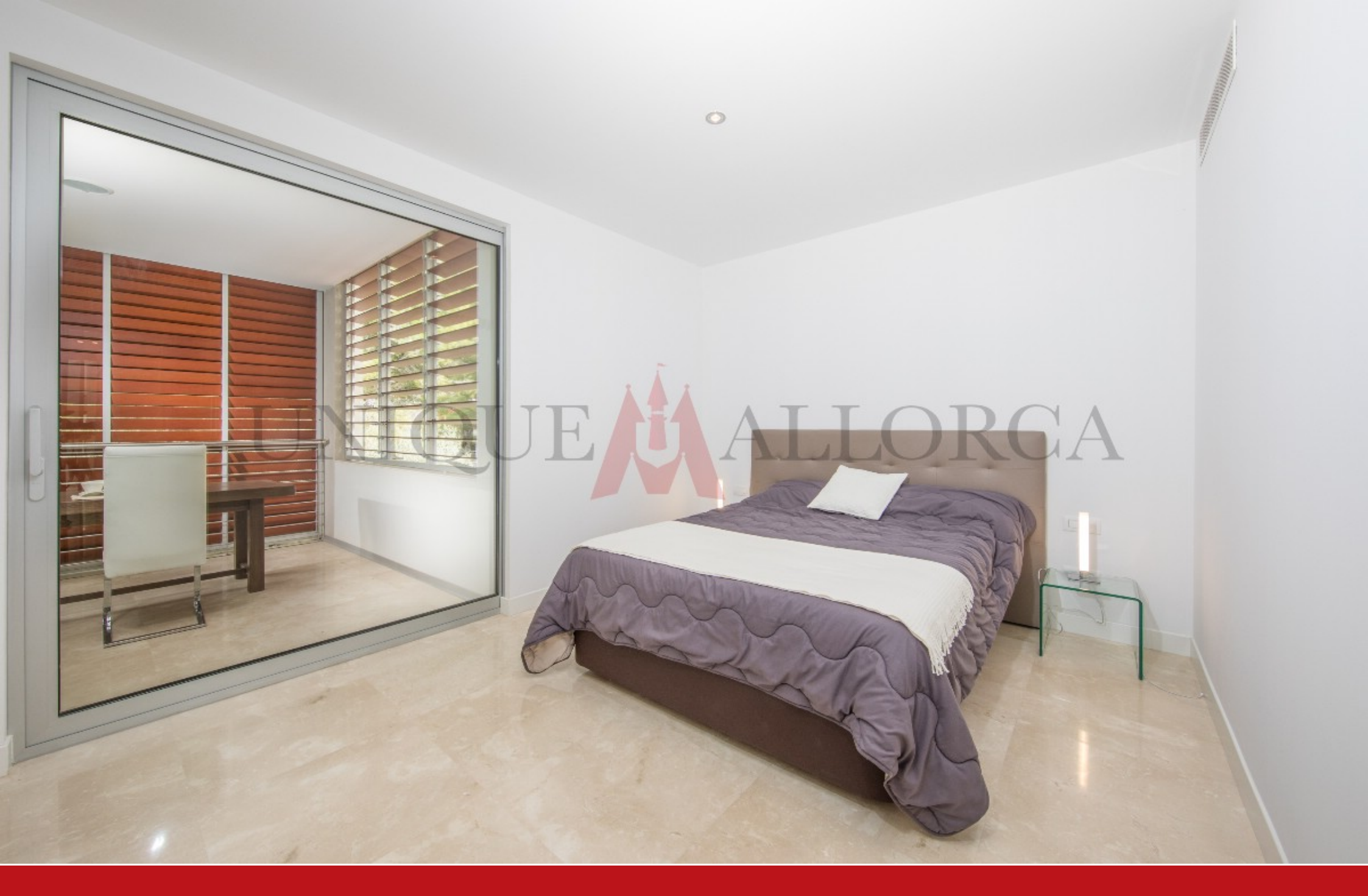
Unique Mallorca Real Estate, Live Happily Ever After