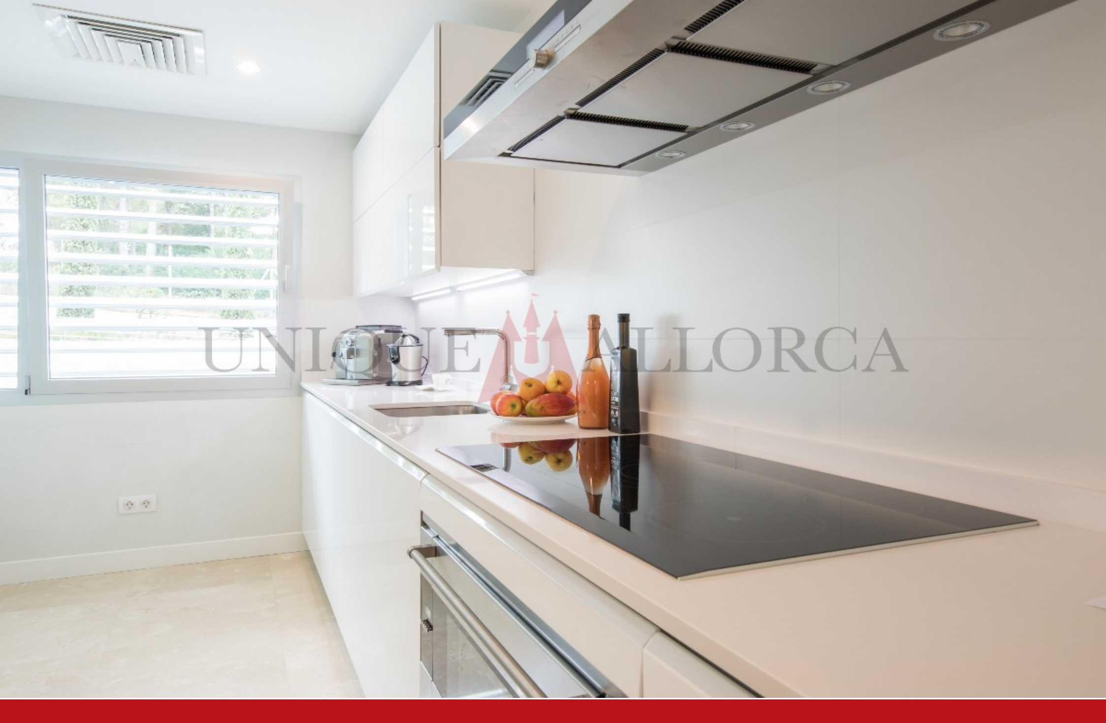
Your Dream Estate, Our Real Estate