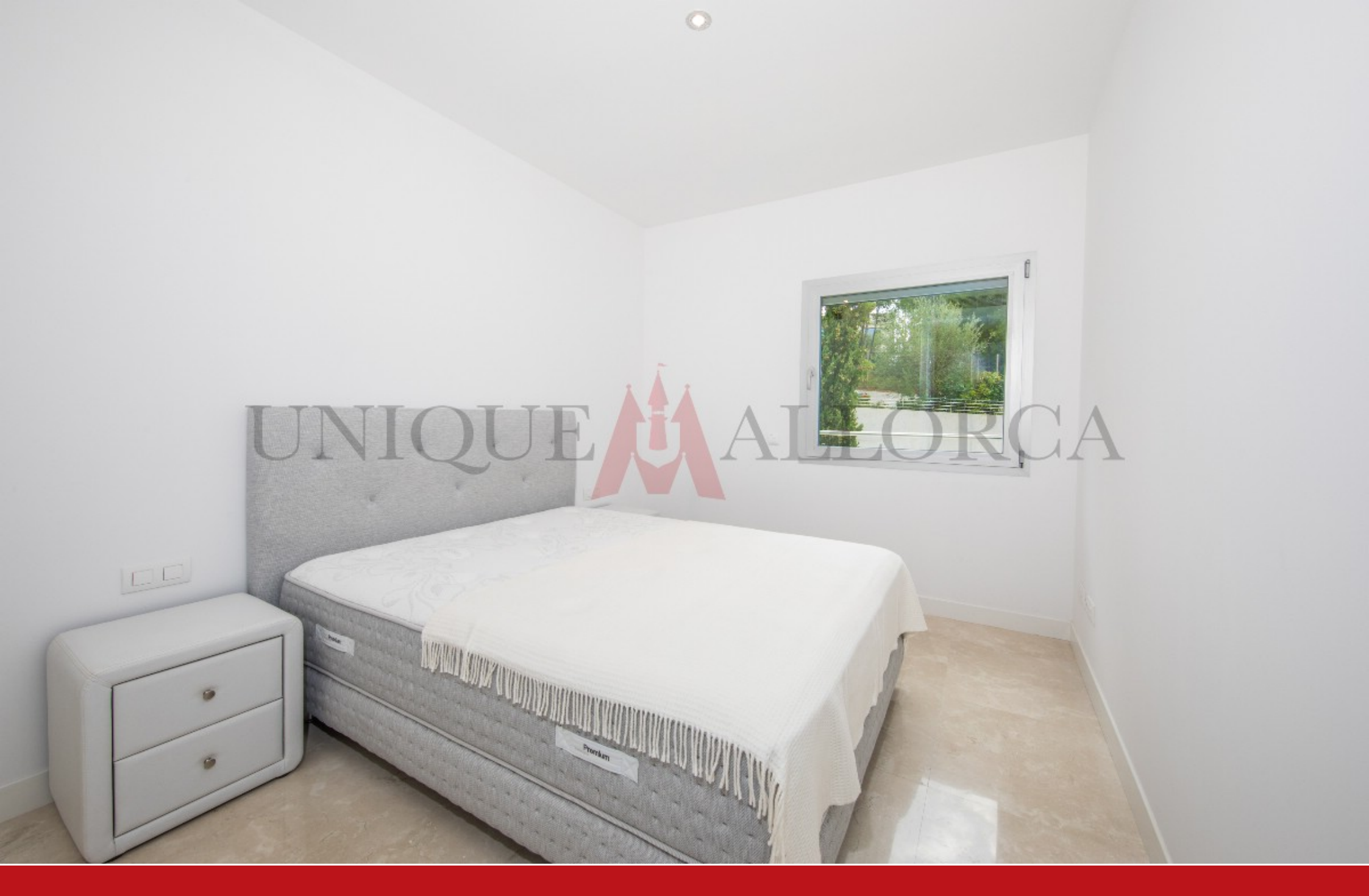
Unique Mallorca Real Estate, Live Happily Ever After