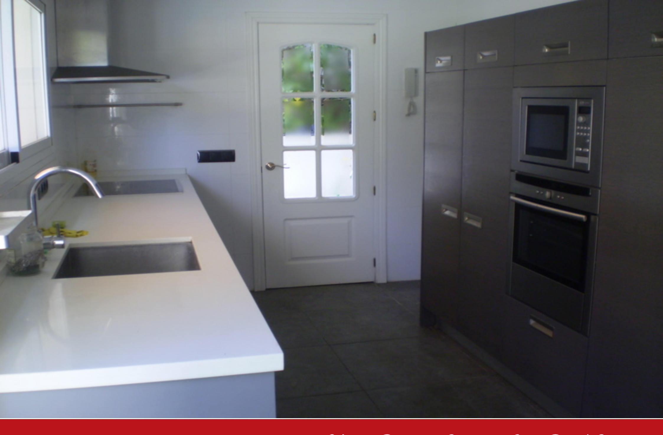
Your Dream Estate, Our Real Estate