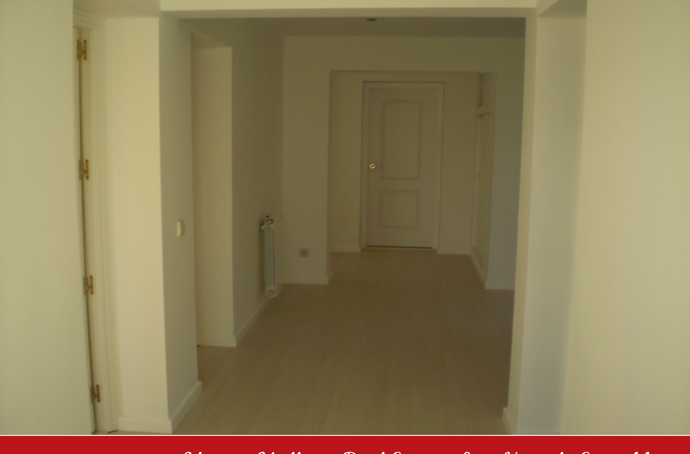
Unique Mallorca Real Estate, Live Happily Ever After