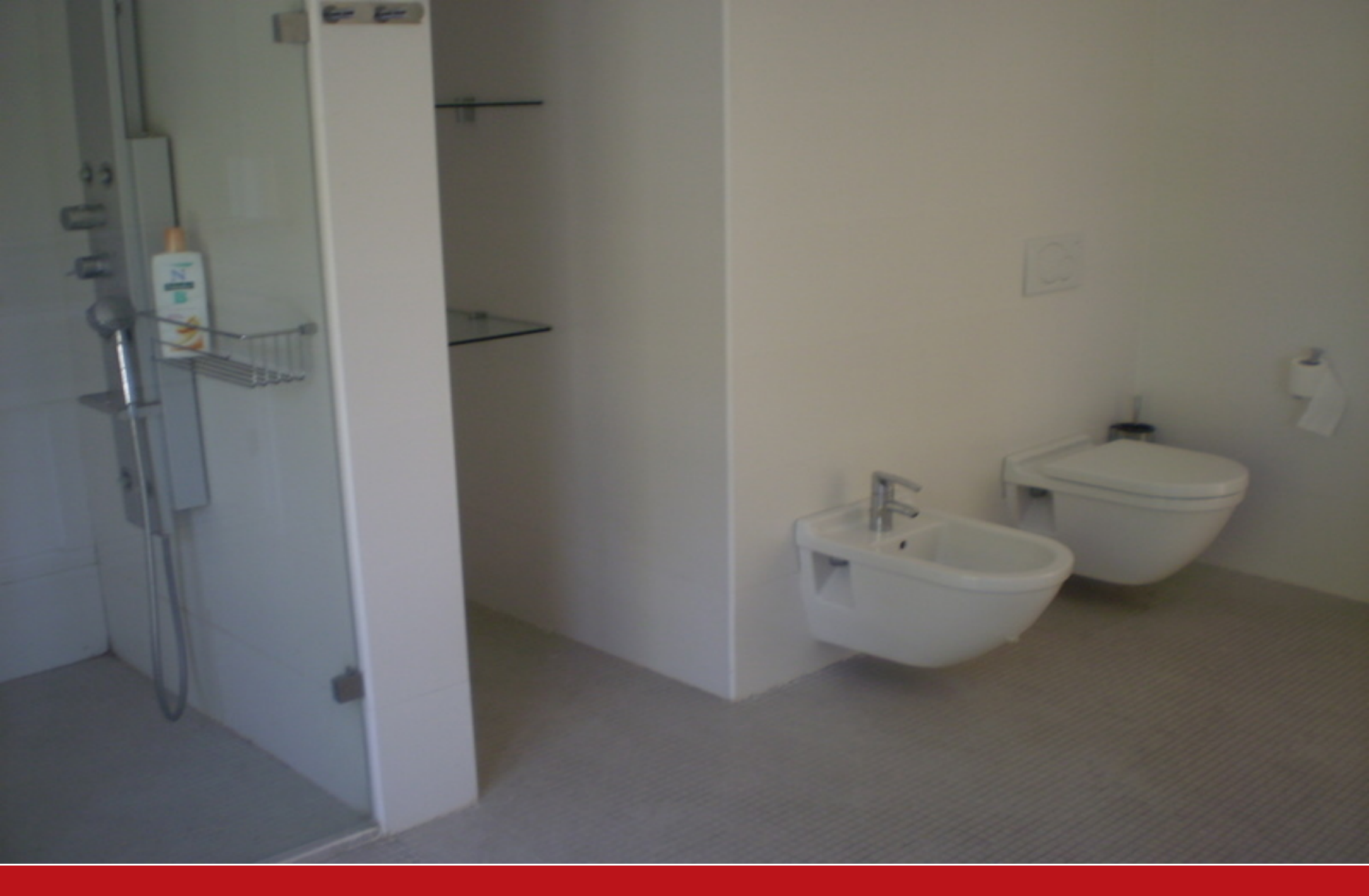
Unique Mallorca Real Estate, Live Happily Ever After