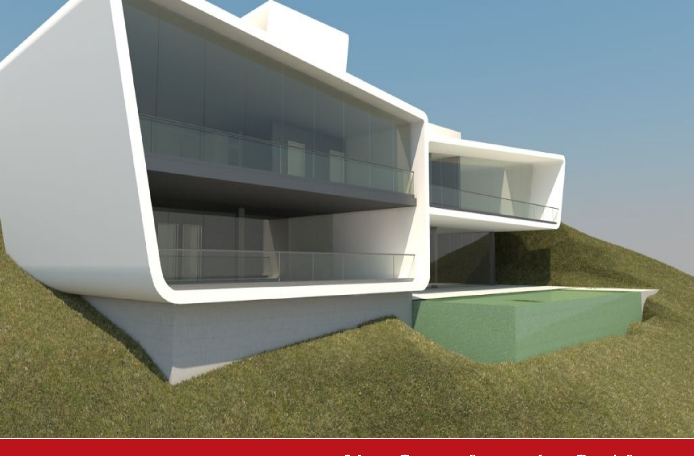
Your Dream Estate, Our Real Estate