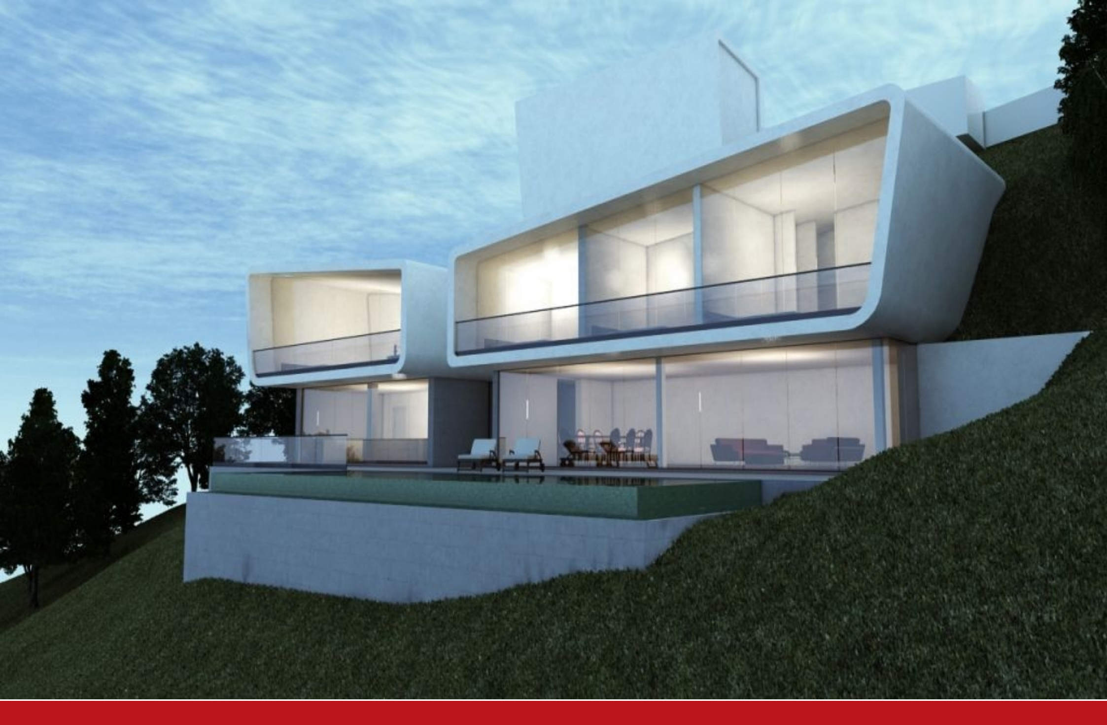
Unique Mallorca Real Estate, Live Happily Ever After