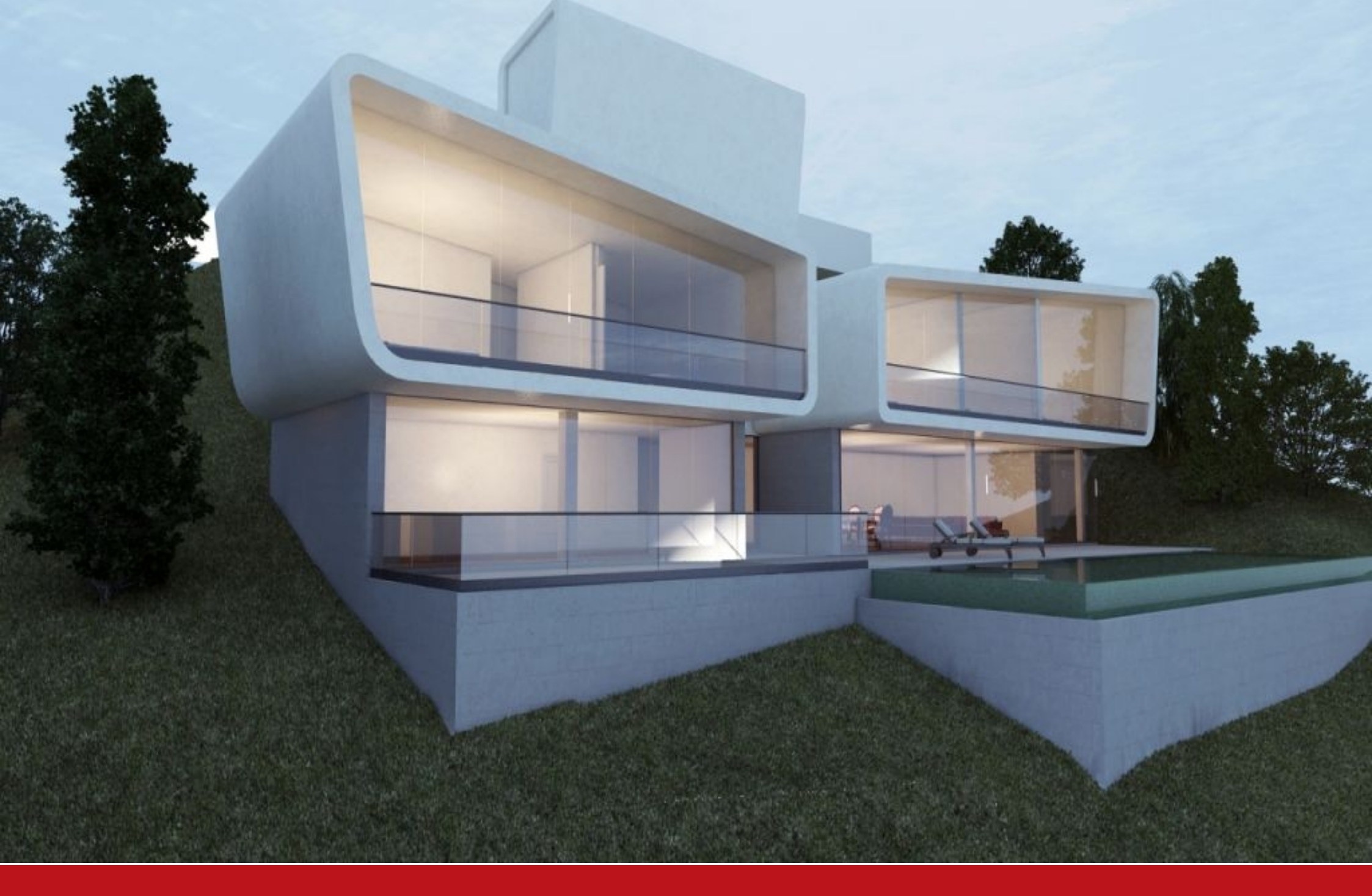
Unique Mallorca Real Estate, Live Happily Ever After