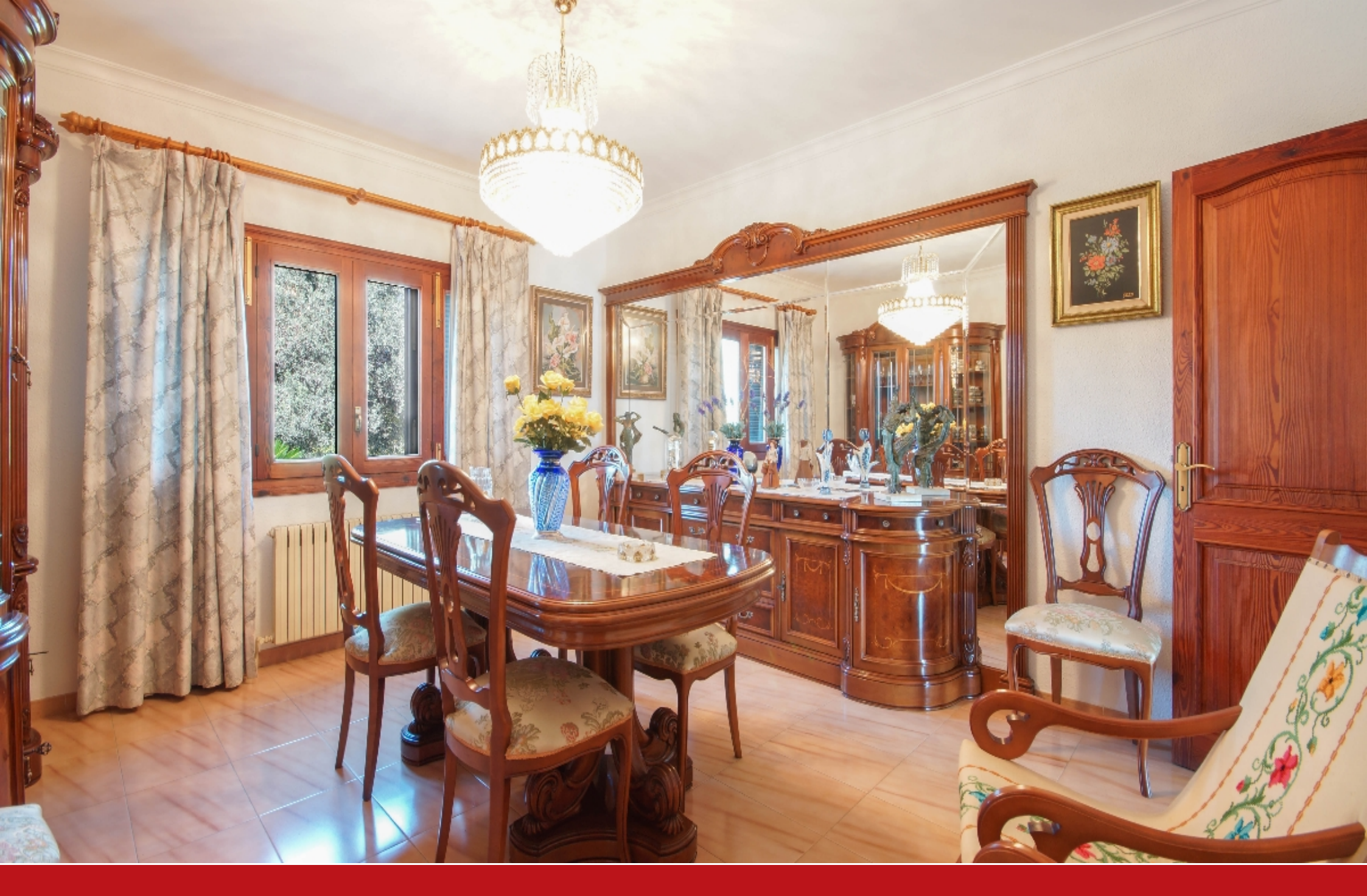
Unique Mallorca Real Estate, Live Happily Ever After