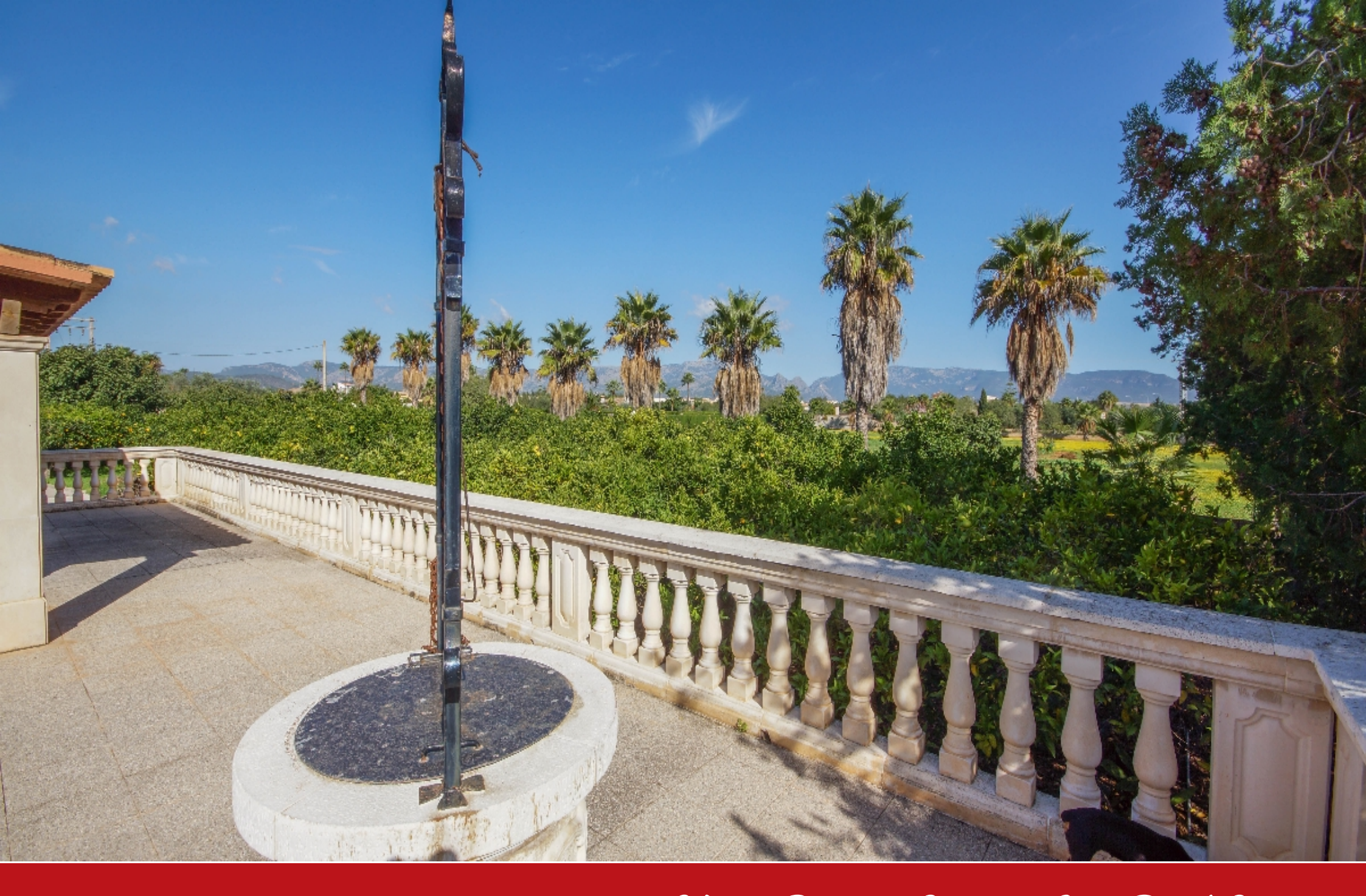
Your Dream Estate, Our Real Estate