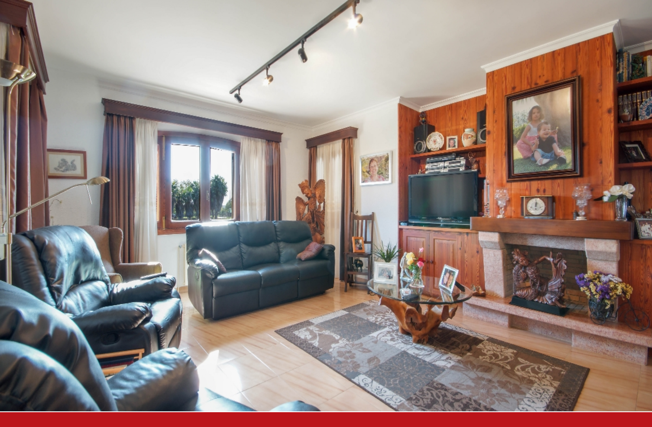
Unique Mallorca Real Estate, Live Happily Ever After